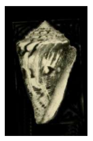
Figure in Smith.

Published in Nautilus, Philad. 60 (1): p. 1, pl. 1, fig. 5. Holotype was in collection H.M. Woolsey of Kent, Connecticut, U.S.A., present whereabouts unknown, (fig. 53 x 30 mm). Type locality Ocho Rios, Jamaica, (fish traps). Nomenclatural status, an available name. Taxonomic status, a synonym of C. centurio Born, 1778.