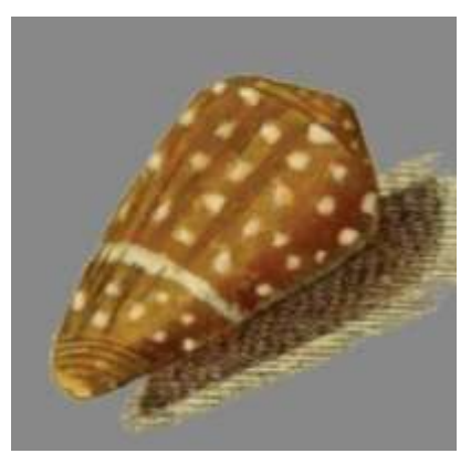
Cited figure in Martini.

Taxonomic status, doubtful (nomen dubium), lost type, no locality, an artificially coloured figure and an inadequate description.