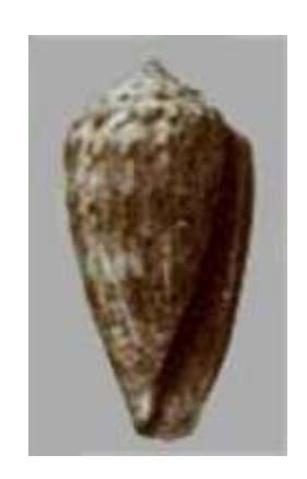
Figures in Bucquoy etc.

<u>oblongus</u> (variety episcopus Hwass) Fenaux, 1942. Published in Bull. Inst. oceanogr. Monaco, (814): p. 2, fig. 1. Three specimens named of C. elongata Adams & Leloup in IRSN. Type locality of C. elongata Adams & Leloup Amboine (Ambon, Indonesia).