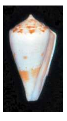
Paratype in KIMN.